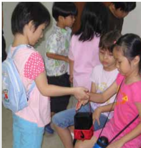
Children continue to worship God through the offering

All of us teachers are ordinary members trusting God to help us to minister to the children. As DL Moody wrote, "God can use any Christian to accomplish His work. If we possess the right heart and the right attitude we become the right kind of person for God to use. Our great God can do very extraordinary works through very ordinary people. All Christians have a place of service to the Lord." ♦