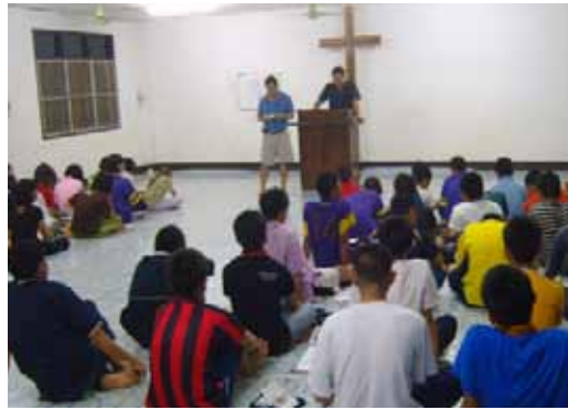
Daily devotions in spartan conditions

impeccable Thai. They were a great help to us both in the Home and when we moved around, especially during meal times. They have three grown children who are staying away from home in Chiang Mai and the US.