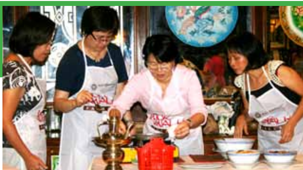
Below: Participants of Ms GBC Nonya