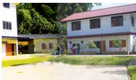
Left, from top: