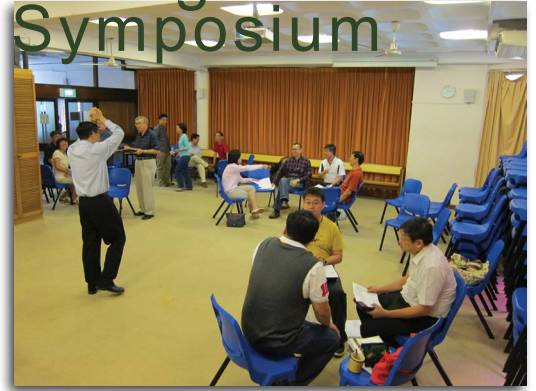
Evangelical outreach programmes conducted in 2011 were reviewed.