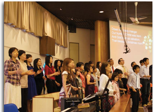
Songs of worship a cappella - the human voice is indeed the greatest musical instrument created by God!