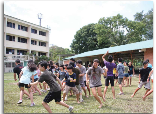
Our youths had great fun at the camp!