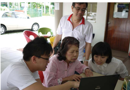
There was a good teacher-student ratio on Gadgets Day.