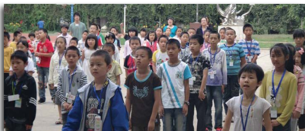
Students of Baima having their morning assembly.

Please pray that the seeds sown may grow and bear fruit. Ω