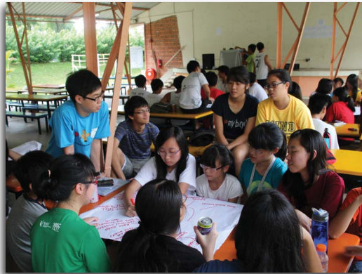
Brainstorming on what it means to be united as a church.