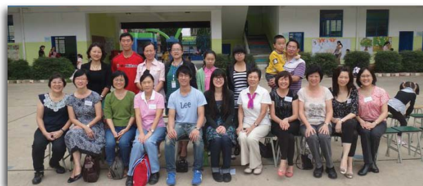
The GBC team with some of the teachers at Baima.