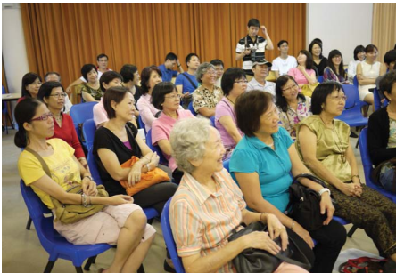
There was a great turnout of seniors on Gadgets Day.