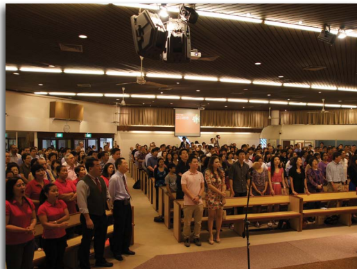
The church offered worship as a gift to Jesus this Christmas.