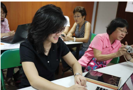
Participants getting advice from young savvy members on the use of their handphones, cameras and laptops.