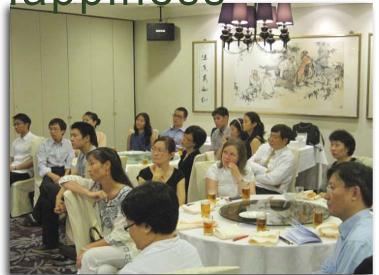
A rapt audience.